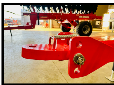
New adjustable hitch 630mm