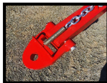
Simple chain and spring assembly on hitch allowing for easy hook up