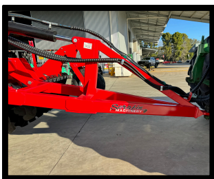
Hydraulic adjustable hitch & tongue to suit 40mm Pin