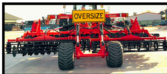
450mm crumble roller with strong support arms & greaseable bearings