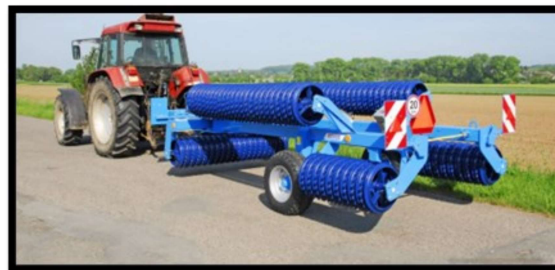
NARROW FOLDED TRANSPORT WIDTH