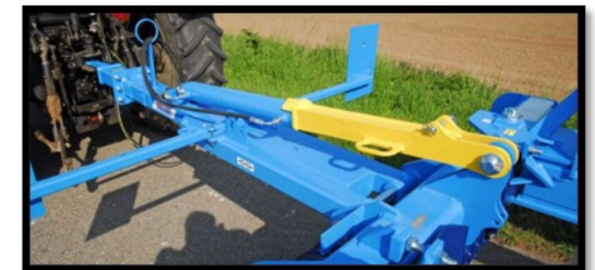
SIMPLE CONTROL WITH PISTON ROD